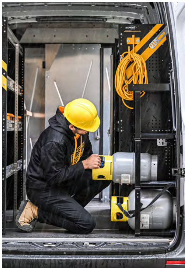
6013-3 Steel Refrigerant Rack

Designed for easy installation, they are compatible with all cargo vans. As an added benefit, extra compartments can be added to the steel bottle holder to increase its storage capacity.